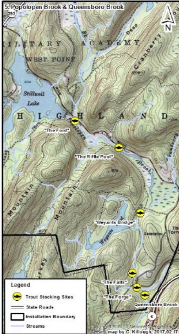
5: Popolopen Brook & Queensboro Brook