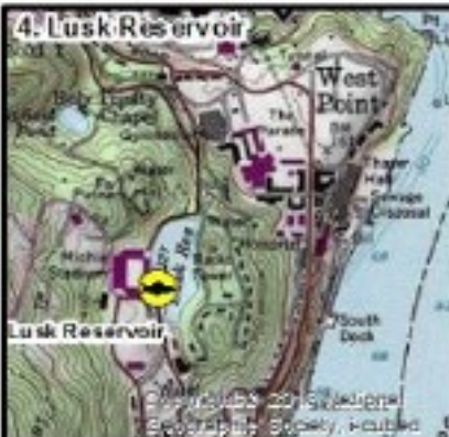
4: Lusk Reservoir