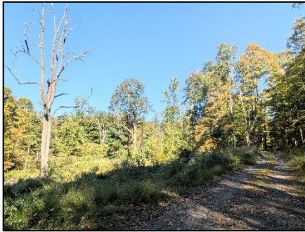
Figure 1. Entrance to Mineral Springs (L), a new pheasant stocking area in 2025.

Greeting hunters, It's that time of year again! Natural Resources Branch staff will be stocking ring-necked pheasants on Tuesday, September 30 th ; and Friday, October 10 th at the following locations: RR15/RR16 Orchard (B), The Landing (I), Old Bridge (L), Mineral Springs (new) (L), LZ - Crow @ Burke (N), Burke West (new) (N), Proctoria Hillside (P), NBC Site (R), and the Block House (T2). Please see attached map for locations of each stocking area. A total of 250 pheasants will be stocked over those two days.