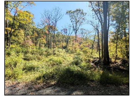
Figure 2. Entrance to Burke West (N), a new pheasant stocking area in 2025.

Late Update (09/28): Due to artillery firing training closing downrange areas E2 and Z2, Natural Resources has decided pheasants will be stocked for the first time at two regenerating timber harvest sites: 1) Mineral Springs (L), located off RR21 about 4/10 th of a mile S of the newly repaired bridge and 2) Burke West, also located off of RR21 about 1/10 th of a mile N of the RR21-RR22 Jct. See photos.