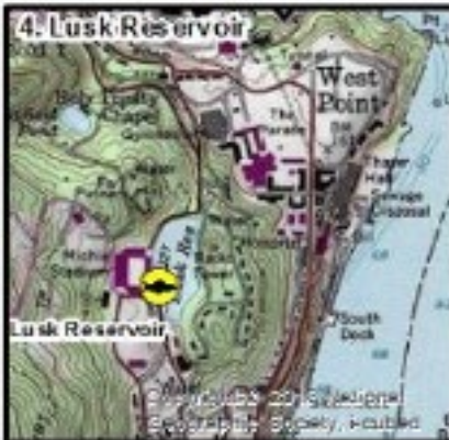
4: Lusk Reservoir